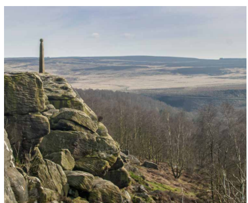
Lord Nelson's Monument

of you. 6 Turn left through the gap in the wall and follow the path all the way down the field – which is scattered with evidence that it was once a Bronze Age settlement – until you reach the stone step over stile in the wall by the main road. 7 Go over the stile and turn left, following the pavement until it takes you back to Birchen Edge car park.